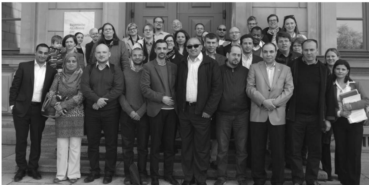
AGYA members in front of the Bavarian Academy of Sciences and Humanities

This conference aims at a novel perspective on the Mediterranean by bringing together the “two cultures” in academia, i.e. the sciences and the humanities. In addition, it seeks to investigate Malta as a physical and cultural space by an on-the-spot approach, exchanging conventional conference venues to visit sites of relevance the dimensions of which are unfolded by experts in the field.