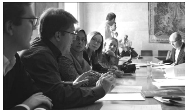
Members of the AGYA Working Group “Common Heritage and Common Challenges” in discussion in the Bavarian Academy of Sciences and Humanities

The members of the AGYA Working Group “Common Heritage and Common Challenges” finalized in Munich the last steps of the preparation for the conference on “Fluid Nature, Fluid Culture. Malta and the Mediterranean”.