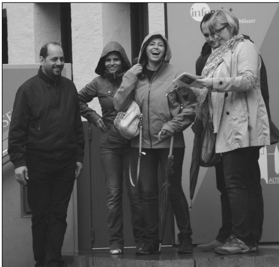
One of the six AGYA teams in action that finally made it to third place

needed to rely on intercultural team work. The same group of scholars convened on the following days in the Goethe Institute and the Bavarian Academy of Sciences and Humanities discussing in the AGYA Working Groups topics like migration in the Mediterranean, the impact of the Arab uprisings on academia, innovation strategies in Arab countries or solutions to tackle water scarcity. These are just two impressions from this year’s annual conference that brought together all current AGYA members.