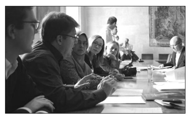
Members of the AGYA Working Group "Common Heritage and Common Challenges" in discussion in the Bavarian Academy of Sciences and Humanities

The members of the AGYA Working Group "Common Heritage and Common Challenges" finalized in Munich the last steps of the preparation for the conference on "Fluid Nature, Fluid Culture. Malta and the Mediterranean".