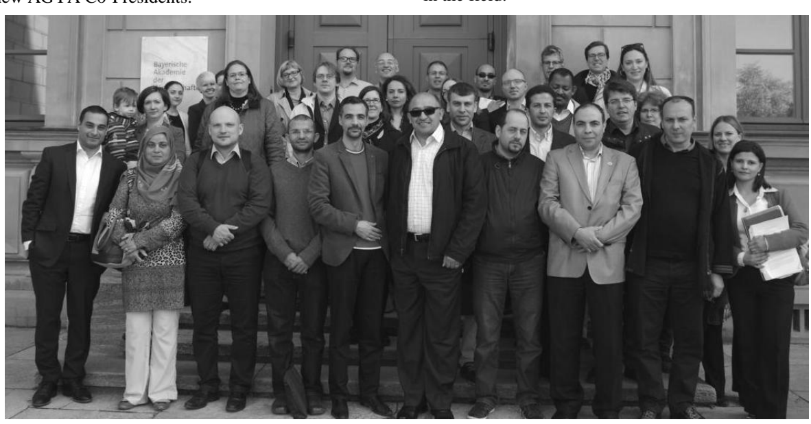
AGYA members in front of the Bavarian Academy of Sciences and Humanities

This conference aims at a novel perspective on the Mediterranean by bringing together the "two cultures" in academia, i.e. the sciences and the humanities. In addition, it seeks to investigate Malta as a physical and cultural space by an on-the-spot approach, exchanging conventional conference venues to visit sites of relevance the dimensions of which are unfolded by experts in the field.