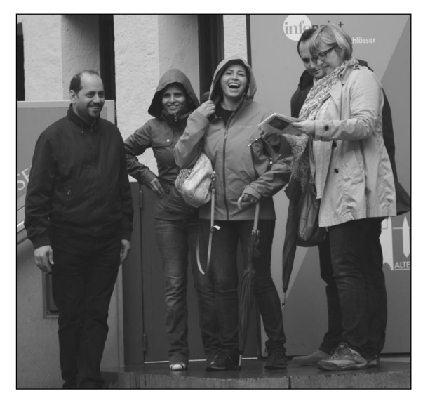
One of the six AGYA teams in action that finally made it to third place

needed to rely on intercultural team work. The same group of scholars convened on the following days in the Goethe Institute and the Bavarian Academy of Sciences and Humanities discussing in the AGYA Working Groups topics like migration in the Mediterranean, the impact of the Arab uprisings on academia, innovation strategies in Arab countries or solutions to tackle water scarcity. These are just two impressions from this year's annual conference that brought together all current AGYA members.