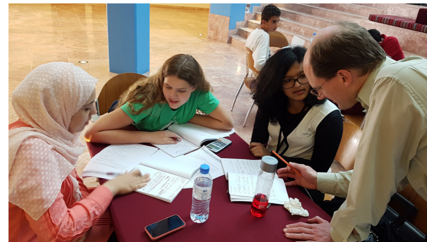
In the problem-solving sessions the young math talents are trained individually.