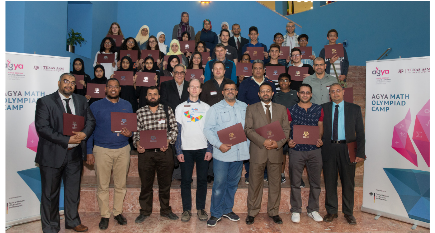
Everyone who successfully participates in the camp receives a certificate.